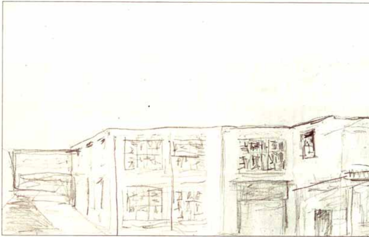
Yale & Towne view II" by Margaret Tsirantonakis

"I used India ink on paper and I cut the paper, assembled it and used pencil to enhance the form," she says. "You can understand so much about how to make a form by drawing in a tiny area and then apply it to a larger painting." Leach says that drawing al-