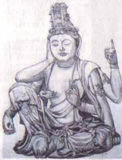
"Japanese Buddha" by Alyssa Siegal